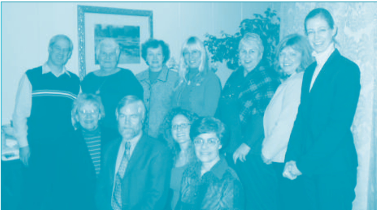
CCSMH STEERING COMMITTEE

CCSMH membership is free. If you wish to become a member of the CCSMH, email fmalach@baycrest.org .